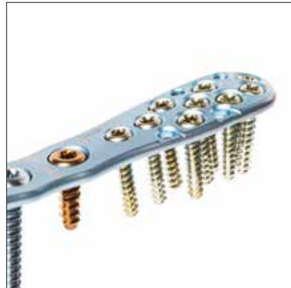
Stable anatomic design for safe preservation of repositioning