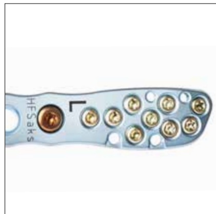
Accurate contour shape of the plate, based on over 100 measured fibulae