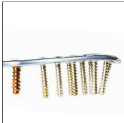
Innovative pre-bending technology of the plate in order to achieve best possible plate - bone alignment