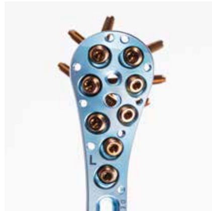
Exact anatomical fit with mandatory definition of the side