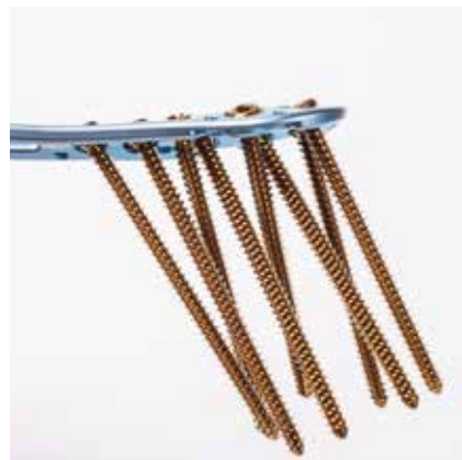
Innovative screw placement for safe support of the joint